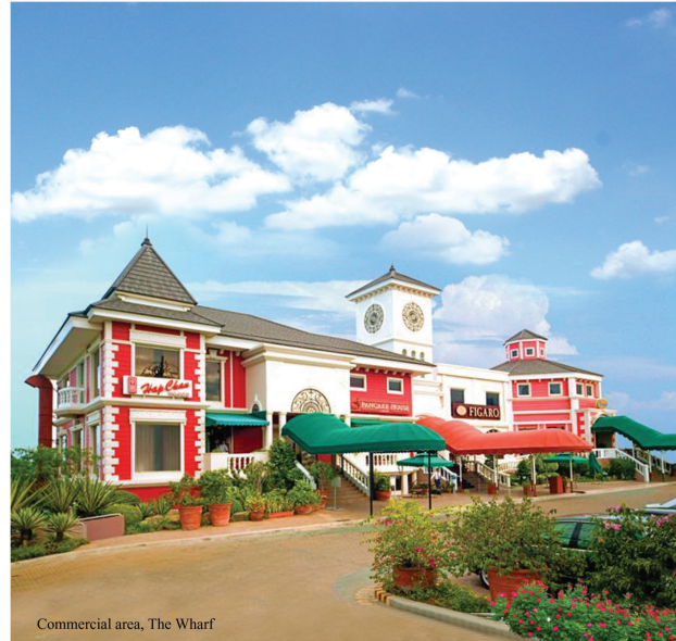
Commercial area, The Wharf