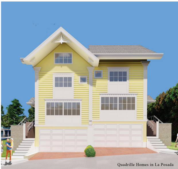
Quadrille Homes in La Posada