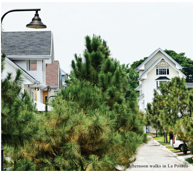
Afternoon walks in La Posada

Postcard-perfect ‘San Francisco’ homes in Sucat