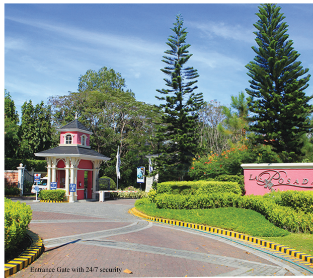
Entrance Gate with 24/7 security