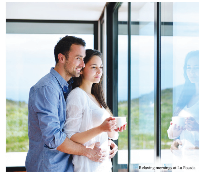
Relaxing mornings at La Posada