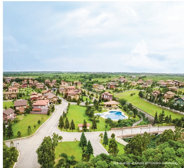
Actual photo of Amore at Portofino Community