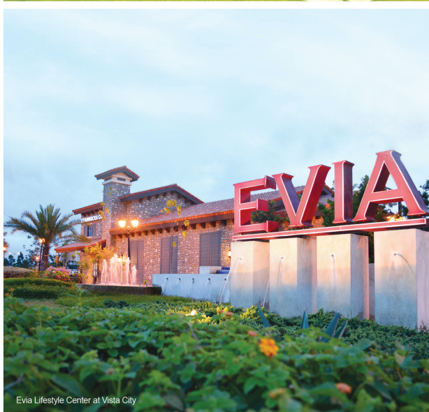
Evia Lifestyle Center at Vista City