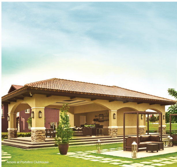
Amore at Portofino Clubhouse