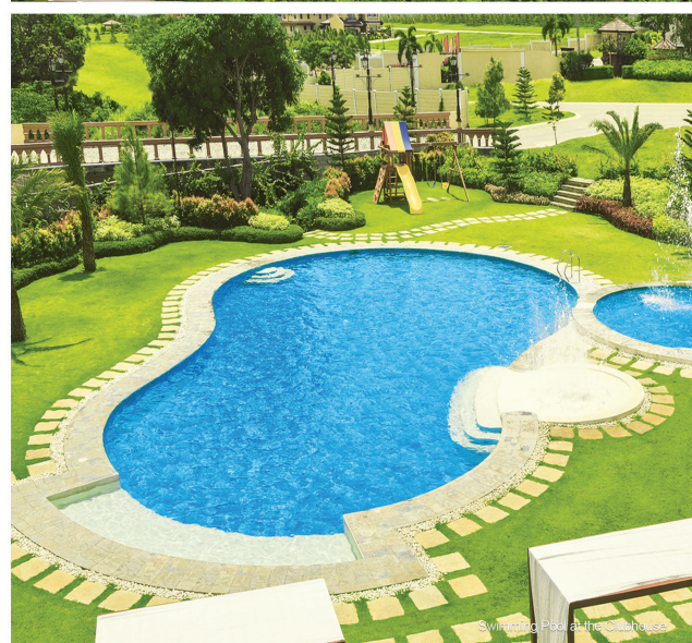
Swimming Pool at the Clubhouse